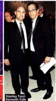
Stanley Tucci Kenneth Cole