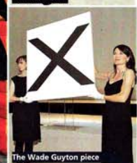
The Wade Guyton piece