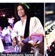
The Polyphonic Spree