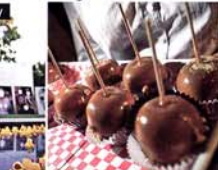
Candy apple goodies