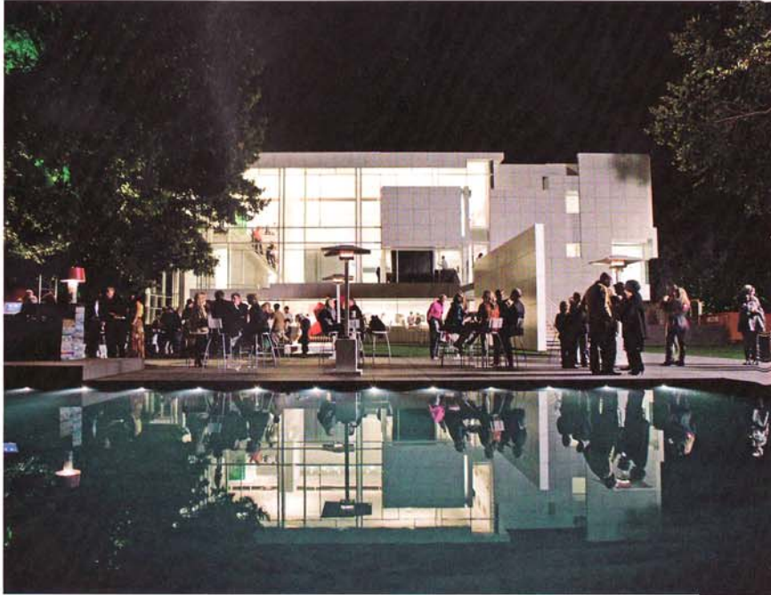
The Rachofsky House