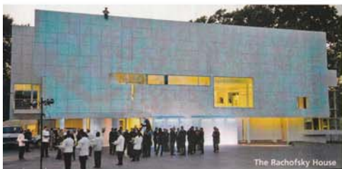
The Rachofsky House