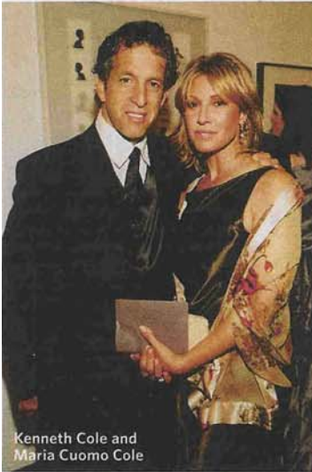
Kenneth Cole and Maria Cuomo Cole